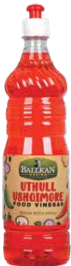
FOOD VINEGAR 950ml

Food vinegar breaks down the chemical structure of protein, such as when used as a marinade to tenderize meats and fish. It is also used for your salads.