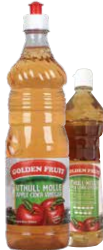
APPLE CIDER VINEGAR 950ml