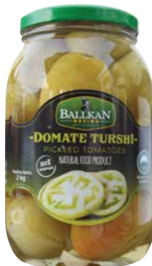
PICKLED TOMATOES 2kg

The pickled tomatoes are characteristic of Korça. It is untreated with chemicals. It is made with fresh garlic, also from our region.