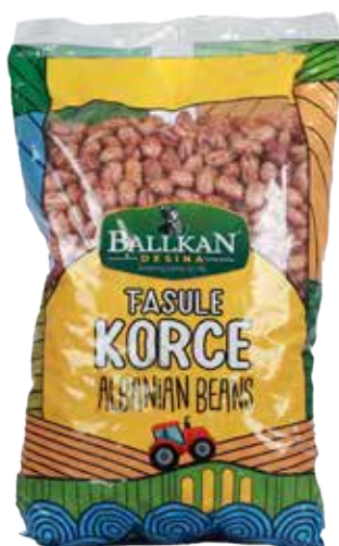
KORÇA'S BEAN 900g

Considering that Albania has a vast bean cultivation, Korça's beans are ones of the most preferred. Geographical position and the climate conditions, helps giving them a unique taste.