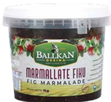
FIG MARMALADE 1Kg

Selected fruits and prepared according to our grandmothers recipes.