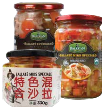
MIX SALAD 580g