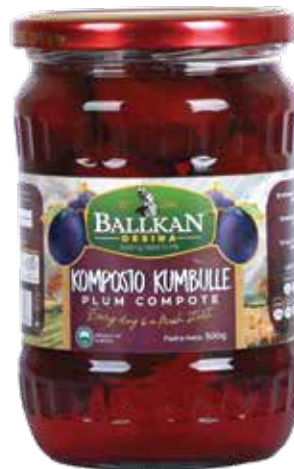
PLUM COMPOTE 500g