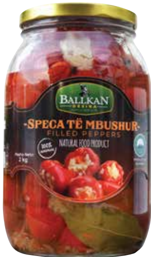
FILLED PEPPERS 2kg

Filled peppers are a traditional product of Korça's region. The type of pepper gives the product its uniqueness and takes you back in time. The seed is hundred of years old and has been passed on from generation to generation.