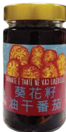
DRIED TOMATOES IN SUNFLOWER OIL