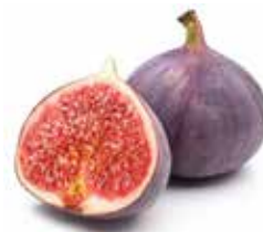
FIG MARMALADE & JAM

Selected fruits and prepared according to our grandmothers recipes.