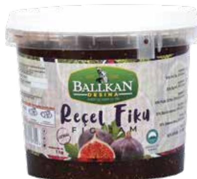
FIG JAM 1Kg