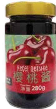
CHERRY JAM 280g