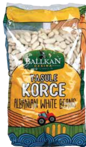
KORÇA'S BEAN 900g