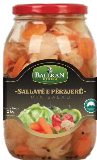
MIX SALAD 2kg

A tradition inherited from generation to generation. Made for the ruling elite.