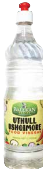
FOOD VINEGAR 950ml