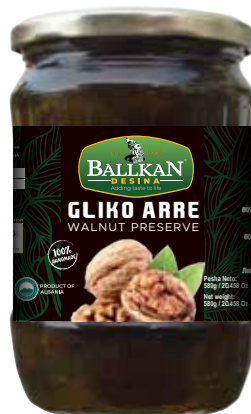
WALNUT PRESERVE 580g