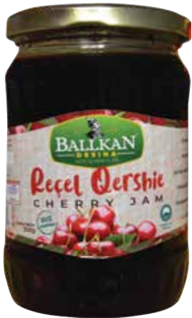
CHERRY JAM 800g

Cherries are unique to our factory. Each of them is hand selected and they are prepared according to our grandmothers recipes.