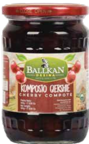
CHERRY COMPOTE 500g

Selected fruits and prepared according to our grandmothers recipes.