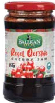
CHERRY JAM 314g