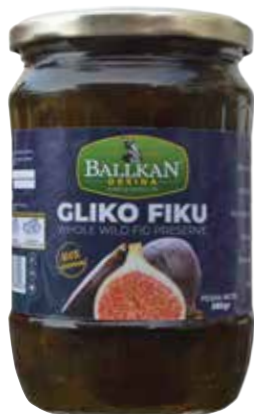
WHOLE WILD FIG PRESERVE 580g

The products are from unique trees, hundreds of years old, untreated with chemicals that can only be found in some villages near Korça. They are selected by hand and have a lot of nutritional values.