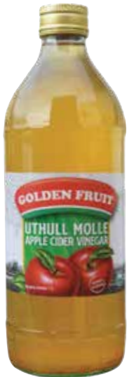
APPLE CIDER VINEGAR 1L

Apple cider vinegar is hand made and it is special because it is unfiltered and not pasteurized.