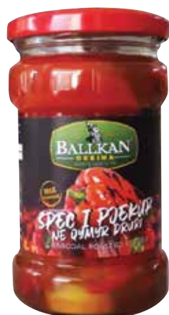
CHARCOAL ROASTED PEPPER