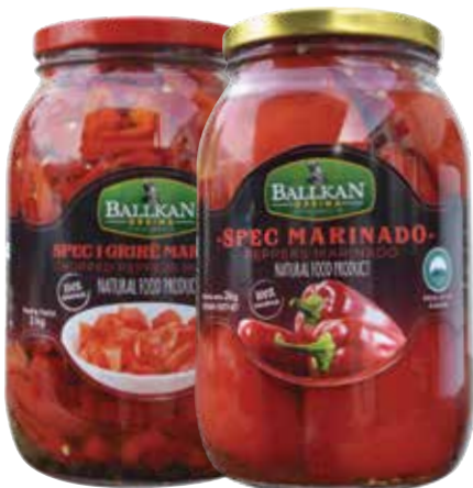
PEPPERS MARINADO 2kg

Peppers are grown in organic farms around Korça and made with their juices.