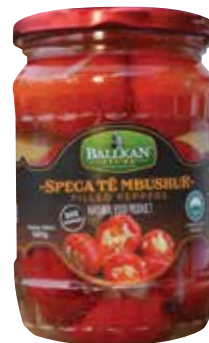
FILLED PEPPERS 580g