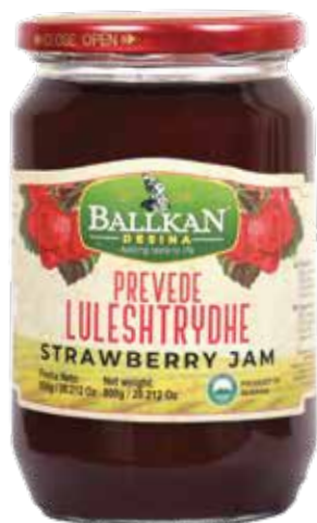
STRAWBERRY JAM 800g

Selected fruits and prepared according to our grandmothers recipes.