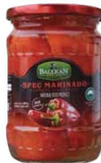
PEPPERS MARINADO 580g