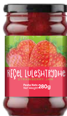
STRAWBERRY JAM 280g